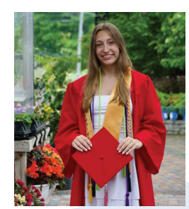
Southern High School